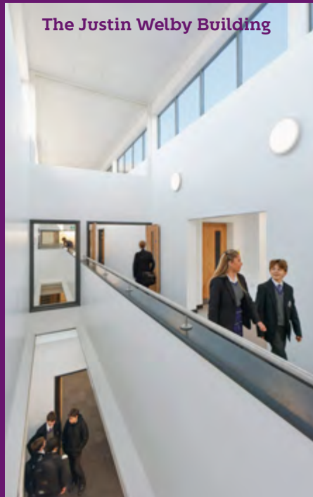
The Justin Welby Building

Music is a huge strength at our school. We aim to build on the Church of England's musical traditions and have many highly capable musicians on the staff and amongst our students. Singing and playing is part of our collective worship and we encourage students and staff to join our choirs, music groups and orchestra.