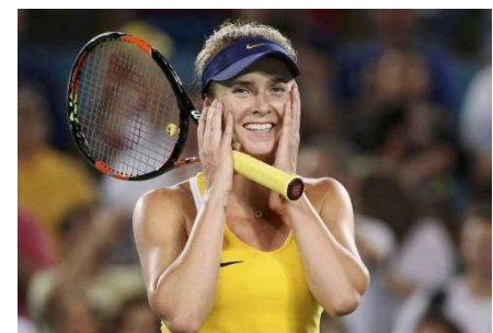
Elina Svitolina

Athletes who are innocent are being denied opportunities because they were born inside Russian borders, and stadiums and sporting facilities are not being given the opportunity to show off their love for their sport. This article has brought to light some of the ways the conflict has interrupted sport across the globe, it has also shown the resolve and character of athletes and sports stars we look up to as we all battle together against the Russian opposition, helping in any way we can, with whatever platform we have.