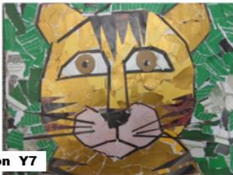
Grace Weedon Y7