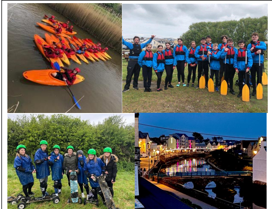
LOOKING FORWARD TO MORE FUN AT BUDE THIS YEAR!

I am always hearing wonderful stories of our students exhibiting the school's values and this brings