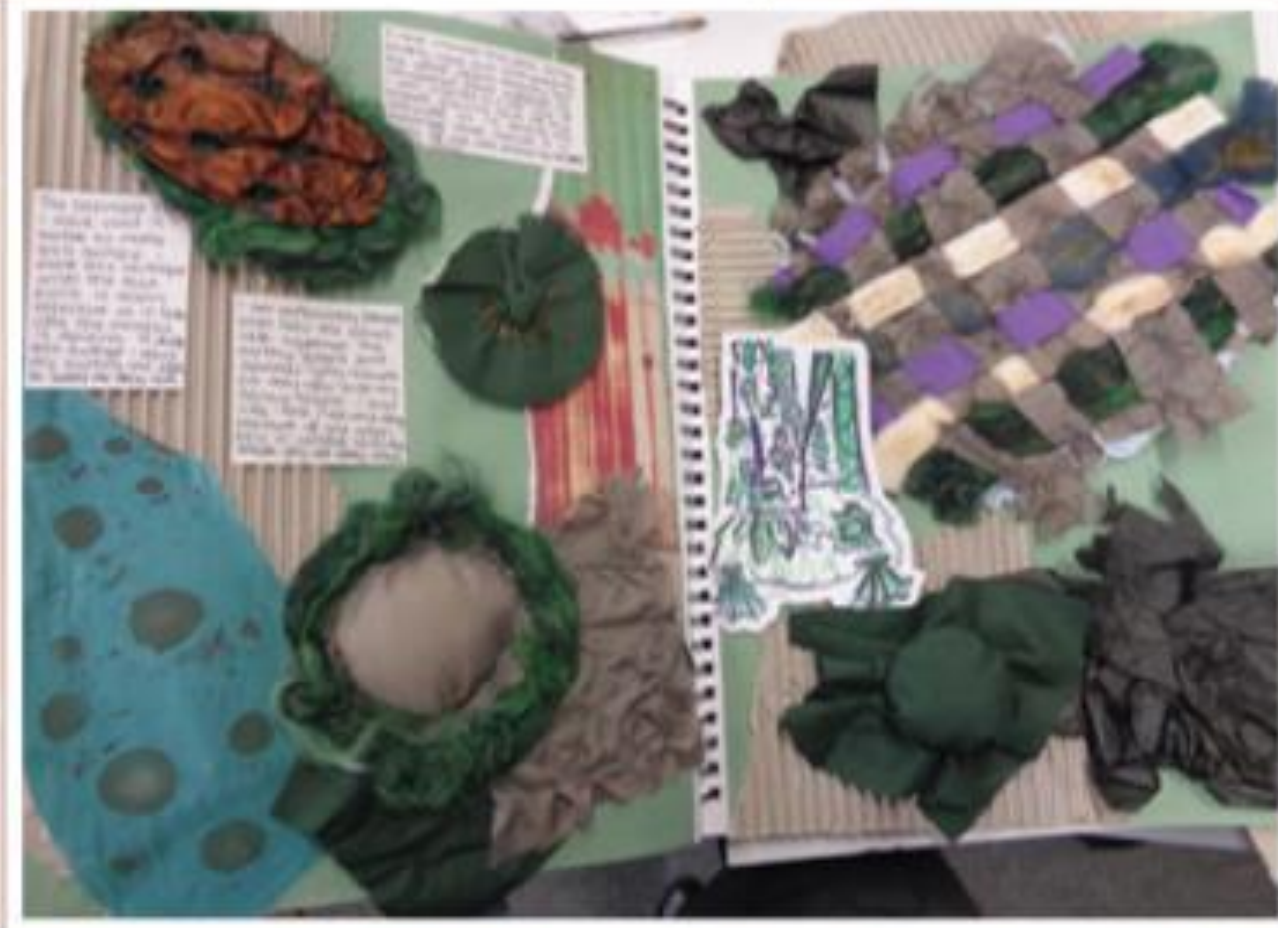
Amelia Hussey Y13