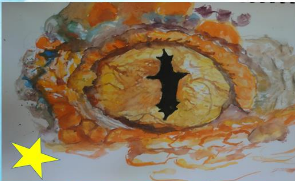
Monty Selwood-Fry Yr 10