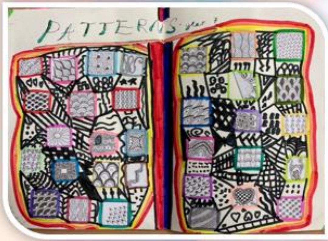
Anca Brescan Y7