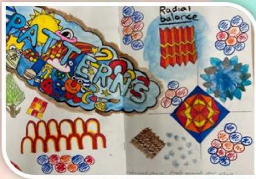
Oskar Golba Y7